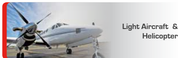
Light Aircraft & Helicopter